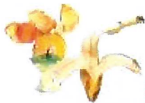
NO Food or Liquids