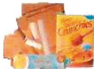
Flattened Cardboard & Paperboard