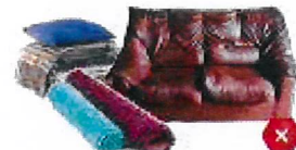
NO Clothing, Furniture & Carpet