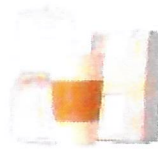
NO Foam Cups & Containers