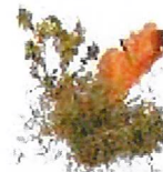
NO Green Waste