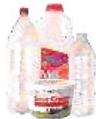
Plastic Bottles & Containers