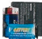
NO Batteries Check local drop-off programs for proper disposal